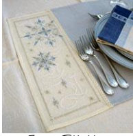
Frosty Table Mat

If you enjoyed stitching this napkin ring, you may like the following designs: