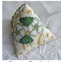
Christmas Rose Humbug