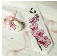
Plum Orchid Bookmark

If you enjoyed stitching this bookmark, you may like the following designs: