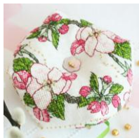
Apple Blossom Biscornu