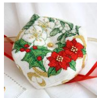
Christmas Biscornu (wreath version)

These designs, and many more, are available on